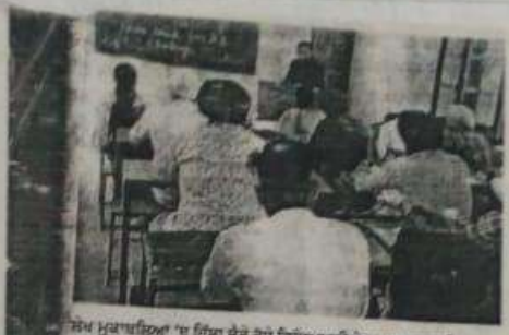
ਲੇਖ ਮੁਕਾਬਲਿਆ 'ਚ ਹਿੱਸਾ ਲੈਂਦੇ ਹੋਏ ਵਿਦਿਆਰਥੀ ਤੇ ਸਾਫ਼ ਸਟਾਫ਼ ਦੀ ਕਲਪਿਤ।

ਗੁਰੂ ਨਾਨਕ ਦੇ ਜੀ ਦੇ 550 ਸਾਲਾ ਪੂਰਾ ਮੁਕਾਬਲੇ ਨੂੰ ਸਮਰਪਤ ਕਰਦੇ ਹੋਏ ਸੰਗਰੇਜ਼ੀ ਵਿਭਾਗ ਵਲੋਂ ਲੇਖ ਮੁਕਾਬਲੇ ਕਰਵਾਏ ਗਏ।